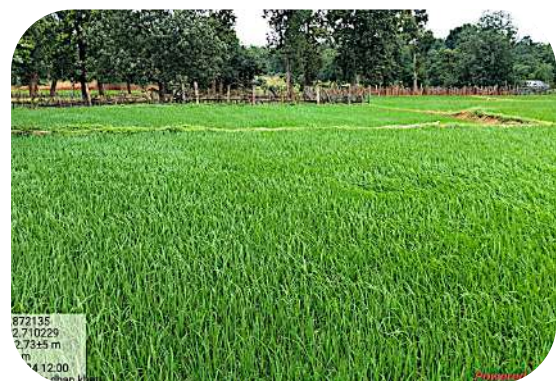
high production rate