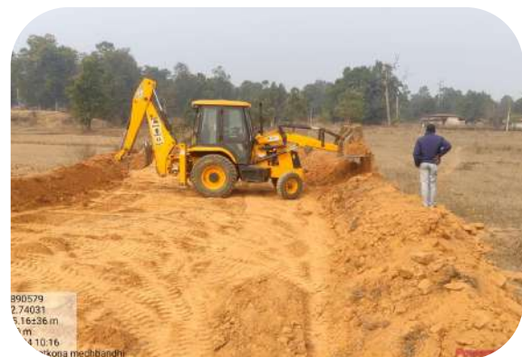
Making land fir for agriculture