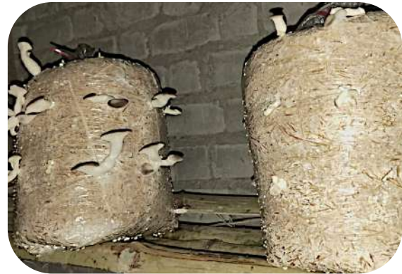
73 Women beneficiaries