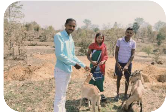
A training on Goat rearing