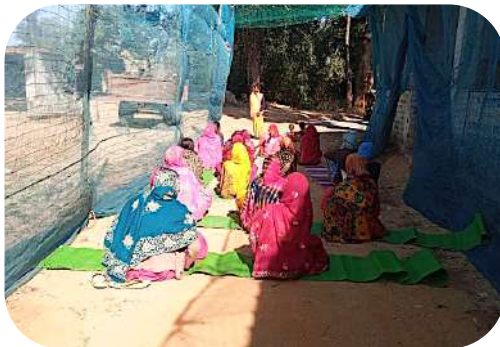
Awarness to Women group