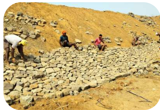
Repaired 12 existing dams