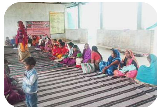
Workshop on Forest conservation