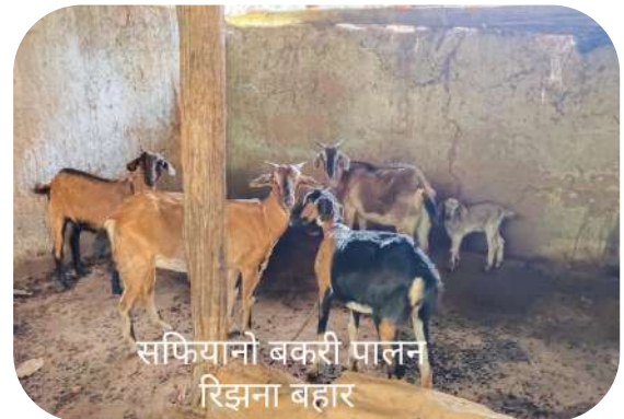
high production rate