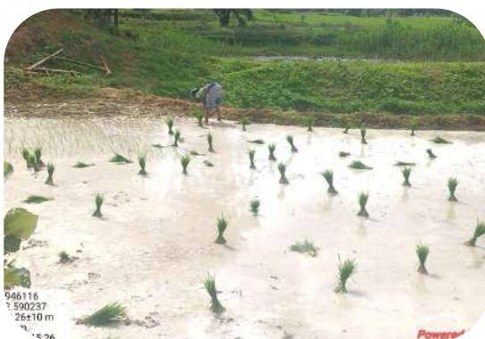
cultivated twice a year