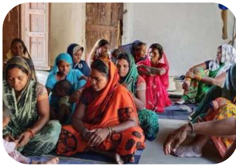
Federation meeting at cluster level