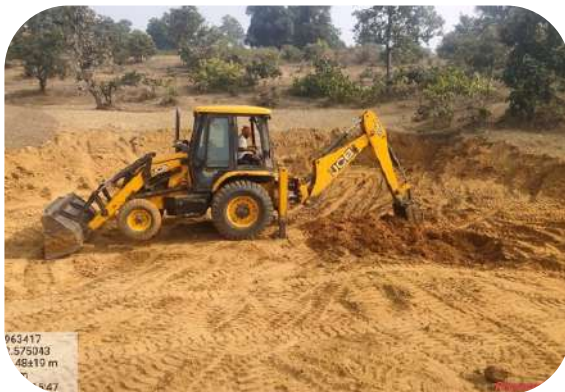
213 Acres of land Rehabilitated in 2024