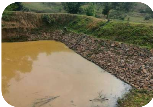
Irrigating 188 acres