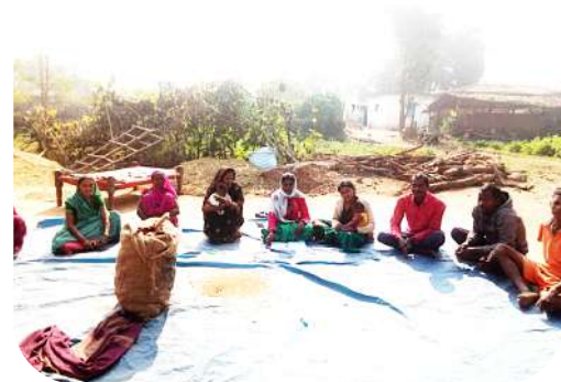
Training for sustainable harvesting protocol