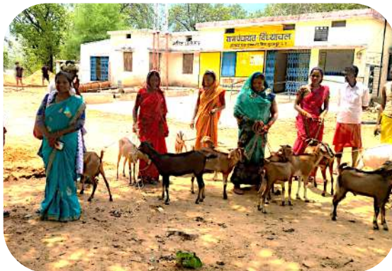
67 Women beneficiaries