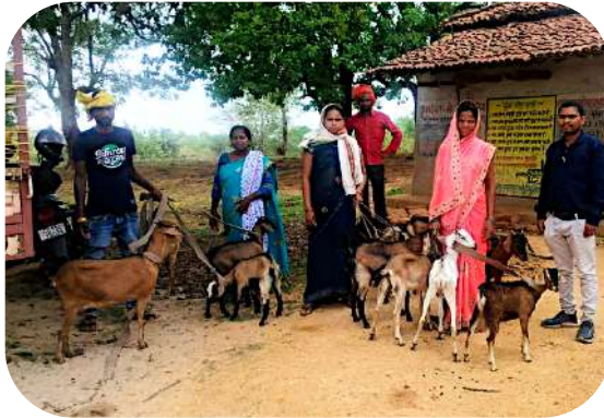
Distributed 148 Goats