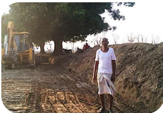
Benefiting 213 families