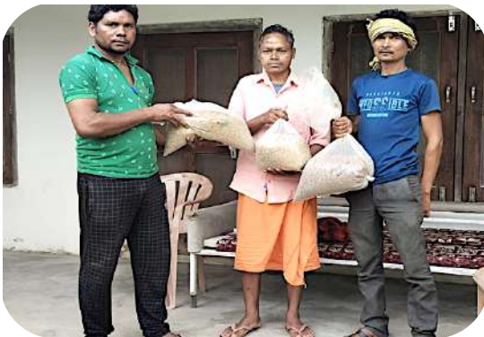
MSS provided seeds to 216 families in 2024