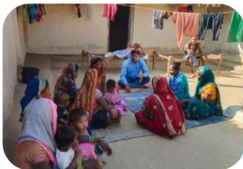
Federation meeting at cluster level