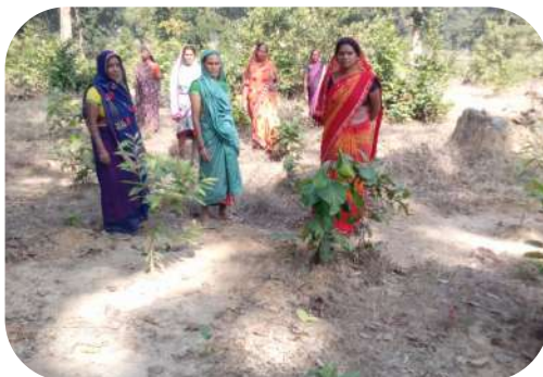
Training on Fighting Forest Fire