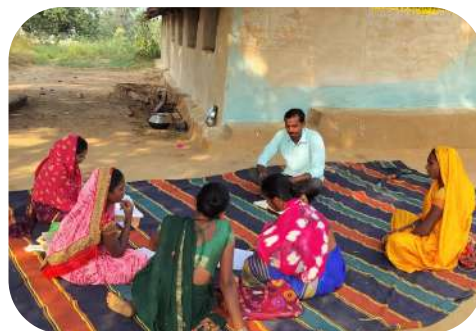
Federation meeting at cluster level