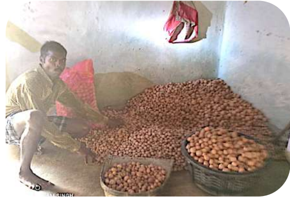
Area cultivated: 20 acres