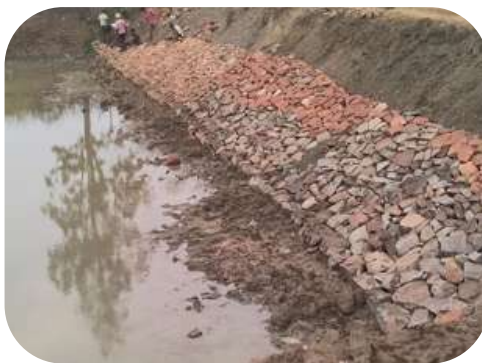
12 new check dams