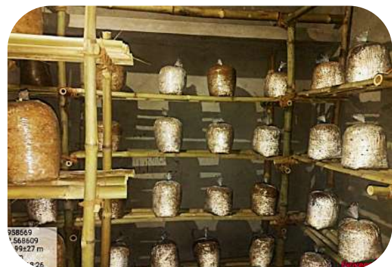
established cultivation units