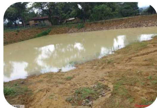
111 families benefited