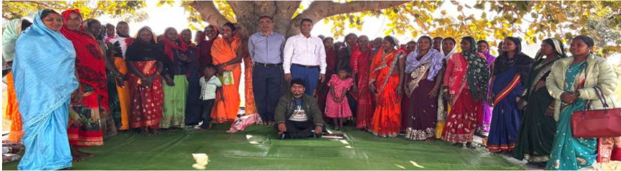
District level Women federation Meeting