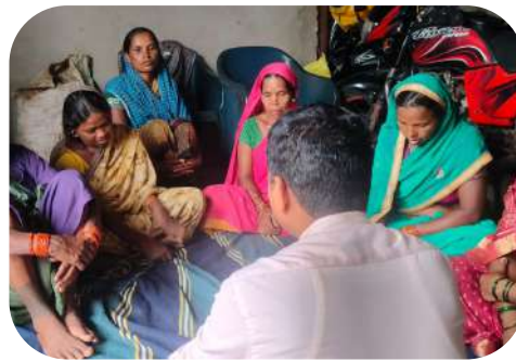
Federation training at village