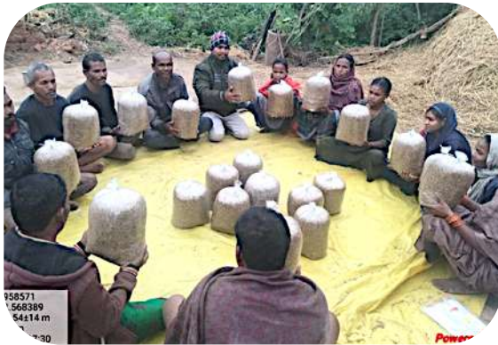
A training on Mushroom cultivation