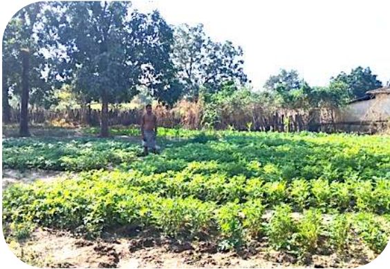
2 training on vegetable cultivation