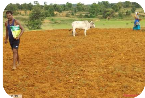
Cultivation on 324 acres of land